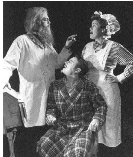
The Perpetual Patient