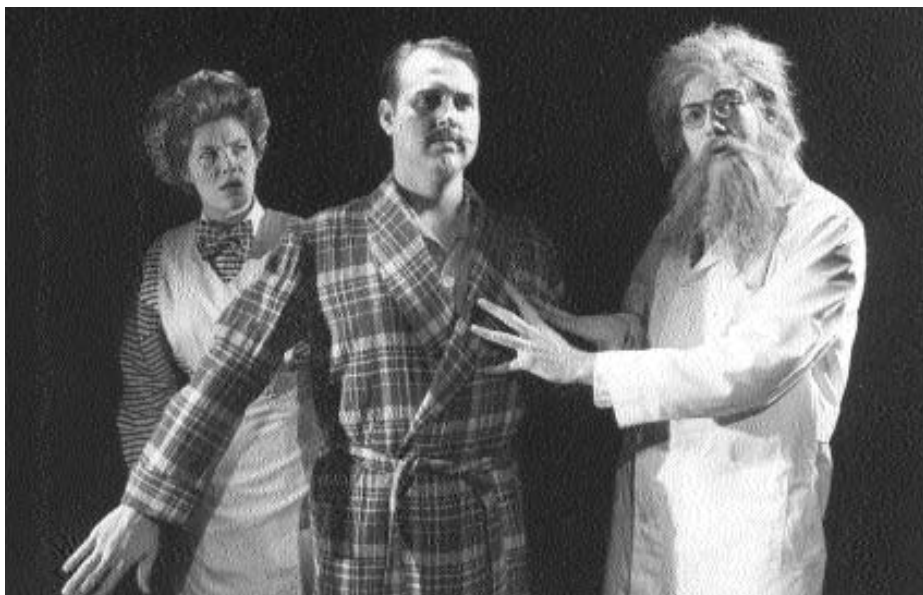
The Perpetual Patient